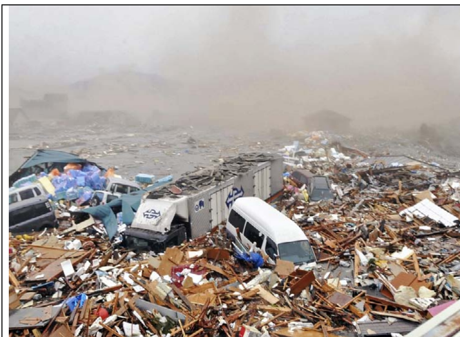
Houses and cars are swept out to sea in Kesenuma City.

<click here for detailed contact information>